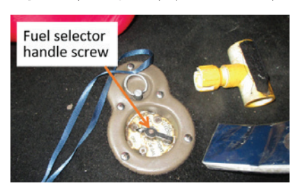
Figure 3. Photograph of fuel selector.

The pilot of a Mooney M20 airplane reported that, during the initial climb from the airport, he noted the engine power slowing, turned on the boost pump, checked the magnetos and fuel mixture, and then attempted to switch the fuel selector to the other fuel tank, which had usable fuel. The engine experienced a total loss of power, and the airplane impacted the ground. A passenger sustained minor injuries, and the pilot and another passenger were uninjured. The fuel selector handle screw was loose and prevented the fuel selector from moving to the fuel tank position for the tank with usable fuel, resulting in fuel starvation and the subsequent total loss of engine power (see figure 3). (GAA17CA260)