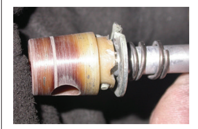
Figure 5. Plug cock showing discoloration, scoring, wear, debris, and a worn detent.