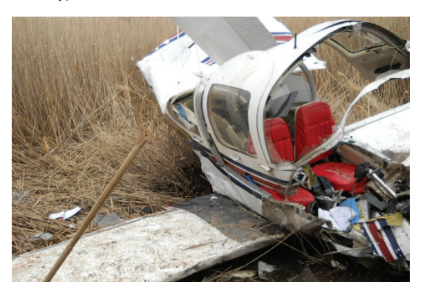
Figure 1. Photograph of accident airplane.

Since 2008, the National Transportation Safety Board (NTSB) has cited the fuel selector in 104 accidents; 63 of those accidents involved incorrect use/operation of the fuel selector, and 28 cited degraded function of the fuel selector. Typically, these types of accidents result in fuel starvation and loss of engine power.