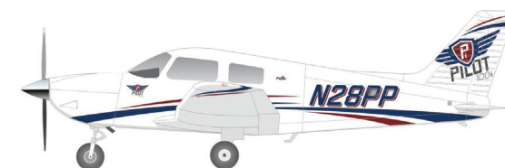
Pilot 100 / Pilot 100i - Paint Scheme