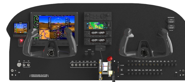
Pilot 100i - IFR Configuration