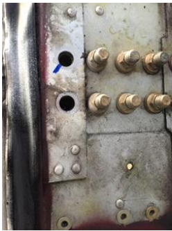
Right Forward Outboard Hole w Crack in Wing Spar Protruding Aft

Call or email us today to schedule your Piper Wing Spar eddy current inspection. Four fasteners pre-removed is all that is needed. Major discounts for multiple aircraft within the same day.