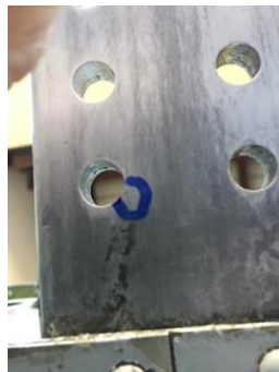
Wing Removed from Aircraft. Crack verified with surface eddy current and 10X Visual