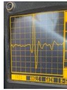
Eddy Current Indication of Crack in Actual Wing Spar

We are an FAA Certified Mobile Repair Station and can return the aircraft to service.